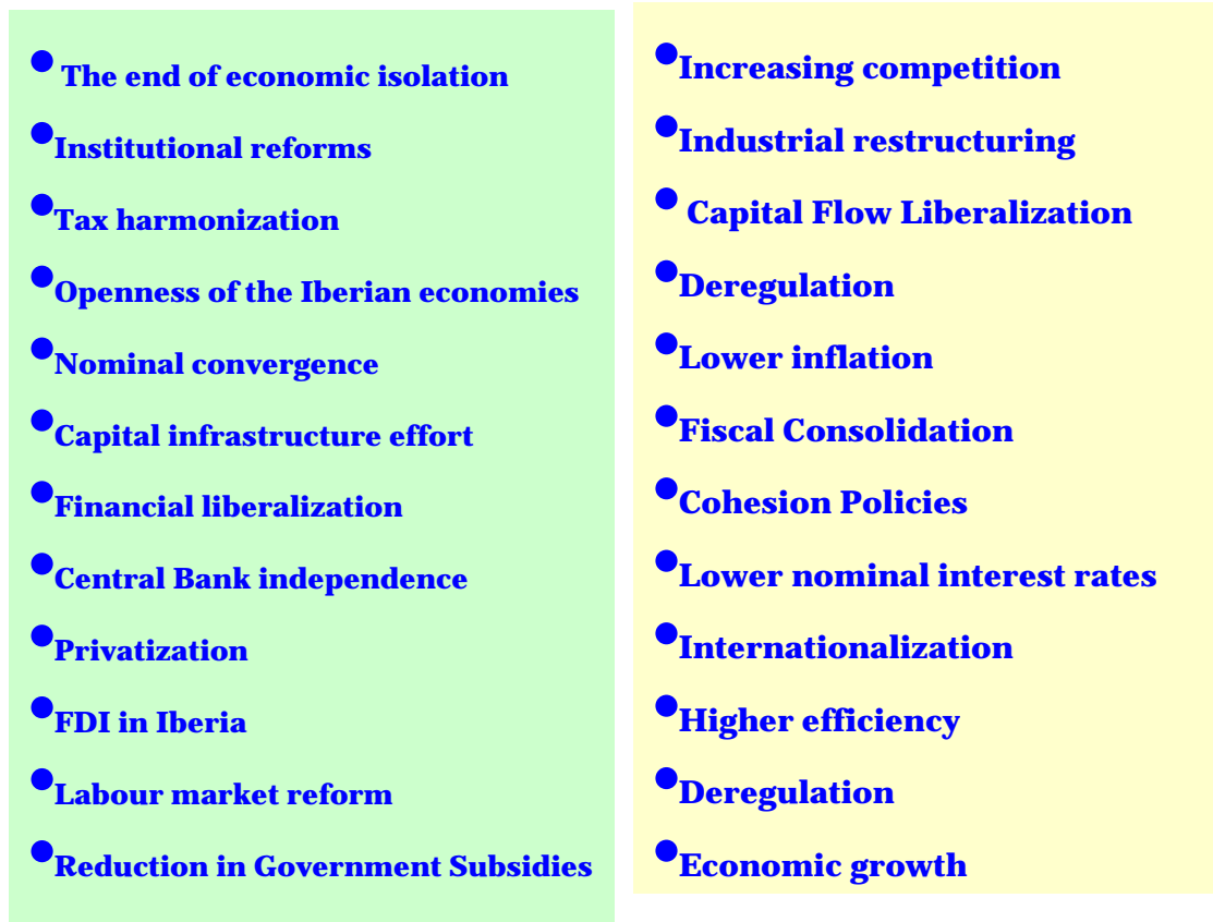
Figure 1: The Iberian Economic Transformation

In terms of static effects , EC accession has resulted on trade creation in the manufacturing sector. Indeed, it has had dramatic effects in trade patterns. 22 As a matter of fact, in the early 1980s the Spanish economy was the least open to industrial trade of any of the EC members. Hence, the participation in a custom union like the EC, has resulted in the dismantling of trade barriers for the other members of the union. Trade liberalization also exposed the highly protected and non-competitive sectors of the economy to foreign competition. 23