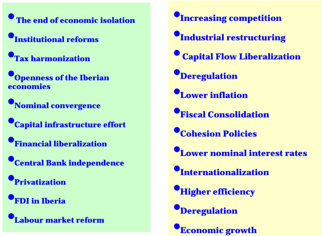
Figure 1: The Iberian Economic Transformation

In terms of static effects , EC accession has resulted on trade creation in the manufacturing sector. Indeed, it has had dramatic effects in trade patterns. 22 As a matter of fact, in the early 1980s the Spanish economy was the least open to industrial trade of any of the EC members. Hence, the participation in a custom union like the EC, has resulted in the dismantling of trade barriers for the other members of the union. Trade liberalization also exposed the highly protected and non-competitive sectors of the economy to foreign competition. 23